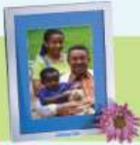
Picture Frame 5 x 7" FRAME HOLDS 3.5 x 5" PHOTOS PRODUCT #8159 $6.95

National Assisted Living Week,® established in 1995 by the National Center for Assisted Living (NCAL), provides a unique opportunity to bring together residents, families, staff, volunteers, and the community to celebrate our elders and the services provided within the assisted living and residential care communities.