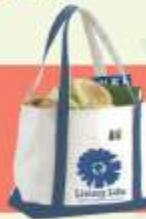
Tote Bag LENGTH 19.75", WIDTH 9"; HEIGHT 13.25" CANVAS WITH 12" REINFORCED CARRYING STRAPS PRODUCT #8165 $14.95