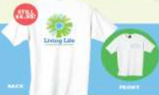
White T-shirt HANES BEEFY T 5 ® – HEAVIER THAN HEAVYWEIGHT PRODUCT #8159 M, L, XL $6.95 PRODUCT #8160 XXL $8.95 PRODUCT #8161 XXXL $9.95