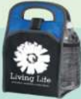
Lunch Caddy APPROX. 7 x 4 INCHES, 12 INCHES TALL PRODUCT #8171 $9.95