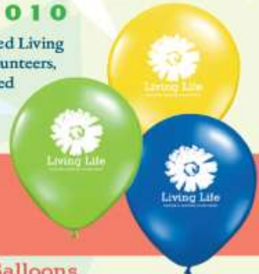
Balloons LATEX; APPROX. 11 INCHES; SOLD IN PACKS OF 10 PRODUCT #8158L (LIME ONLY) (1 PACK) $4.95 PRODUCT #8158B (BLUE ONLY) (1 PACK) $4.95 PRODUCT #8158Y (YELLOW ONLY) (1 PACK) $4.95 PRODUCT #8158S (30, 10 OF EACH COLOR) $11.95