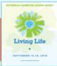
Poster APPROXIMATELY 22 x 28 INCHES PRODUCT #8156 $8.95 (SET OF 4)