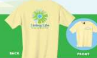
Yellow T-shirt HANES BEEFY T 5 ® – HEAVIER THAN HEAVYWEIGHT PRODUCT #8162 M, L, XL $8.95 PRODUCT #8163 XXL $10.95 PRODUCT #8164 XXXL $11.95